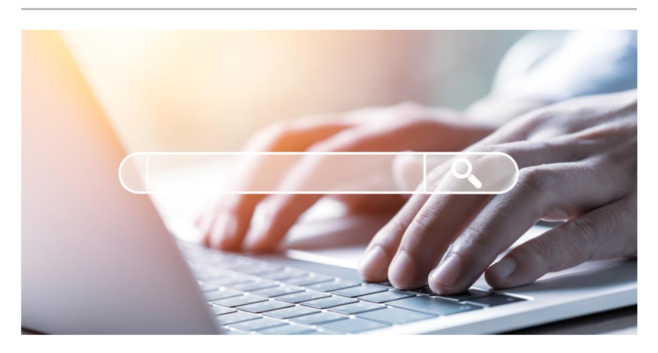
SEO is one of the most important concepts of the internet business today.

A creative and friendly SEO will appeal to your visitors and as a result they will come back again and again. Creating an effective and friendly SEO is by no means an easy task.