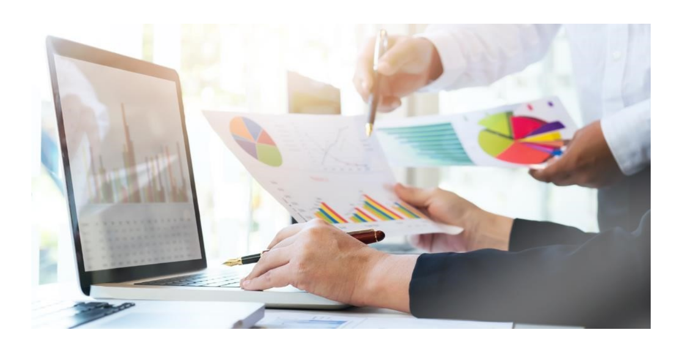
There's more than one way of creating a successful and profitable sales funnel.

There's several methods, in fact, that can help you to make profit from your product offers. You will learn about some of these different methods below.